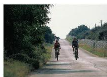
ROAD TO LUN