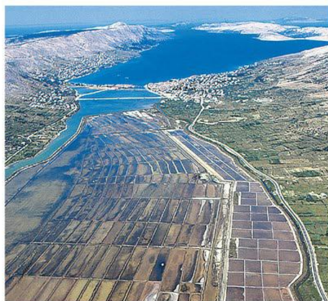
SALT-PANS IN PAG

KOLAN - situated in the inner part of the island, 4 kilometres from the sea. It is often said that Kolan is the agricultural centre of the island. Kolan is surrounded by fertile ground on which vegetables and fruits (mostly grapes) are raised. One can visit a small but attractive ethnographic collection in Kolan.