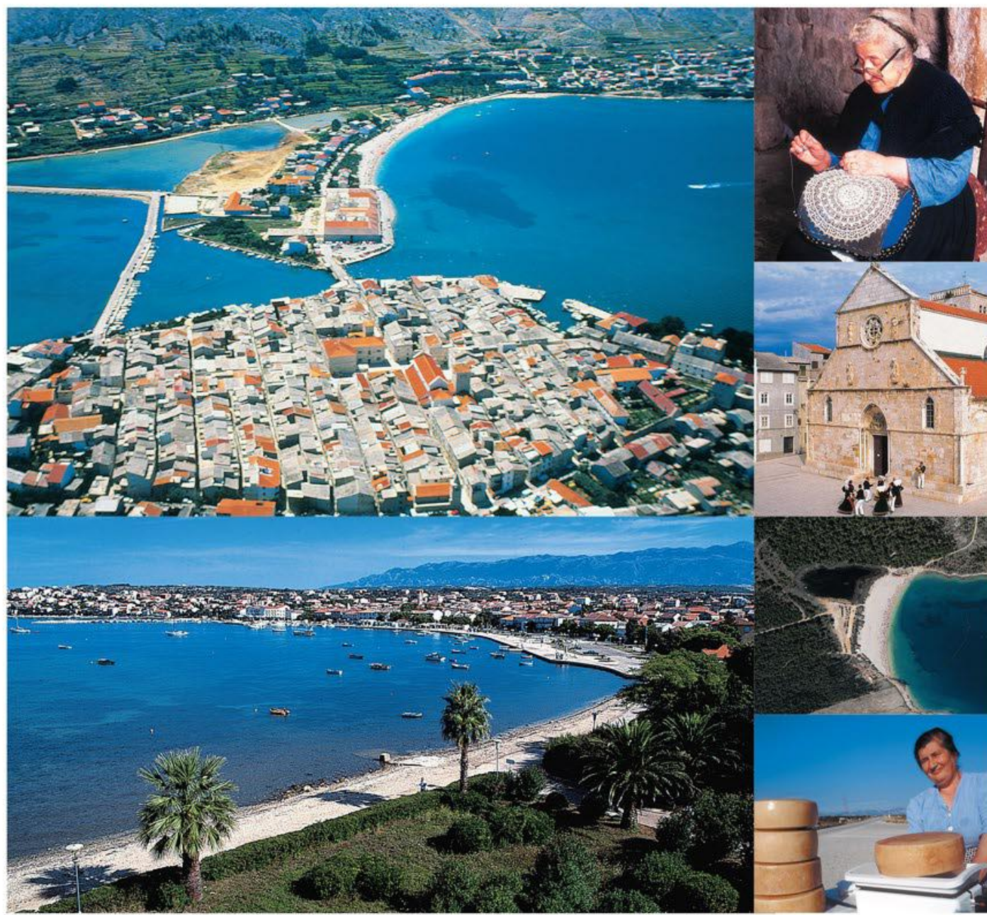
PANORAMAS OF THE CITIES OF PAG AND NOVALJA

MANDRE - A hamlet and a little marina between Šimuni and Kolan. Situated on the sunny side of the island. It overlooks the isles Škrda and Maun. Northwards from Mandre there is the first tourist settlement on the island - Gajac. (built in the first half of 1980's).