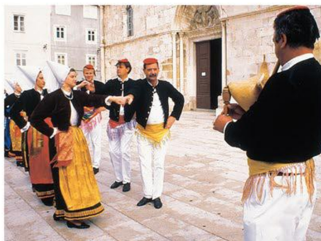
TRADITIONAL DANCE "PAŠKI TANAC"

The remnants of three basilicas from the early christian period (4th century) can still be seen inside the church of St Mary in the very centre of the town. Not far away from the church there is the antique subterranean aqueduct from the 1st A.D. known as Talijanova buža (Italian's hole) entirely