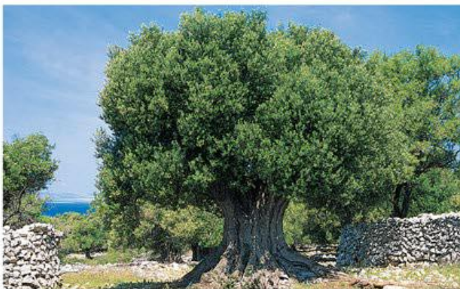
OLIVE TREES IN LUN